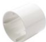
CP090000 Surface mounting box for LIGHT UP and CP...