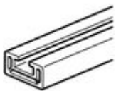
TB250CA Aluminium busbar with "C" shape - In= 25...