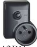
4142PC Mobile connected French/Belgian standard...