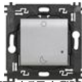
NT4574CW Wireless Night&Day scenario control. Dev...