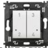
N4575CW Wireless scenarios control equipped with...