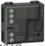
3584C Connected lighting micromodule. It allow...