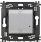
NT4570CW Home / Away wireless switch. It is equip...