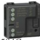
3584C Connected lighting micromodule. It allow...