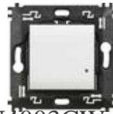
N4003CW Wireless light switch. It allows the ON ...