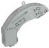
4027C Connected micromodule for shutters. Asso...