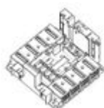
M7B25 Base 3P with front terminals for circuit...