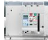
T804LE2000 Draw-out version air circuit breaker 4P ...