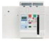
T804L630 Fixed version air circuit breaker 4P - I...