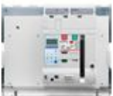
T804LE630 Draw-out version air circuit breaker 4P ...