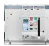
T804AE4000 Draw-out version air circuit breaker 4P ...