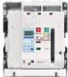
T804HE2500 Draw-out version air circuit breaker 4P ...