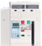
T804B630 Fixed version air circuit breaker 4P - I...