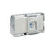
T803LE6300 Draw-out version air circuit breaker 3P ...