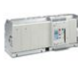
T804LE6300 Draw-out version air circuit breaker 4P ...