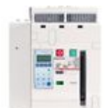
T804A1250 Fixed version air circuit breaker 4P - I...