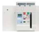
T804L3200 Fixed version air circuit breaker 4P - I...