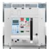
T803LE630 Draw-out version air circuit breaker 3P ...