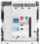
T804AE800 Draw-out version air circuit breaker 4P ...