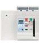
T804L1600 Fixed version air circuit breaker 4P - I...