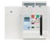
T804L800 Fixed version air circuit breaker 4P - I...