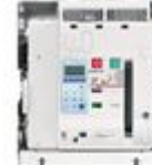
T804AE1600 Draw-out version air circuit breaker 4P ...