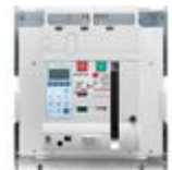
T803LE3200 Draw-out version air circuit breaker 3P ...