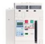
T804A2000 Fixed version air circuit breaker 4P - I...