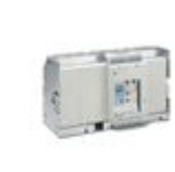
T803LE5000 Draw-out version air circuit breaker 3P ...