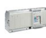
T804LE5000 Draw-out version air circuit breaker 4P ...