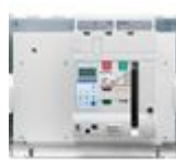
T804AE3200 Draw-out version air circuit breaker 4P ...