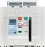
T803A3200 Fixed version air circuit breaker 3P - I...