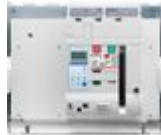
T804LE1250 Draw-out version air circuit breaker 4P ...