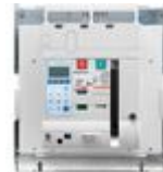
T803AE3200 Draw-out version air circuit breaker 3P ...