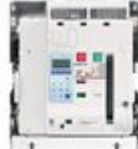
T804AE1250 Draw-out version air circuit breaker 4P ...