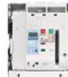
T804HE2000 Draw-out version air circuit breaker 4P ...