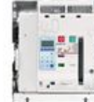
T804AE2000 Draw-out version air circuit breaker 4P ...