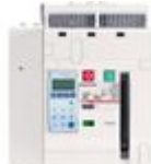
T804B1000 Fixed version air circuit breaker 4P - I...