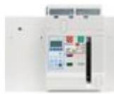
T804L2500 Fixed version air circuit breaker 4P - I...