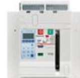
T803L800 Fixed version air circuit breaker 3P - I...