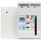
T804L4000 Fixed version air circuit breaker 4P - I...