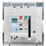
T803LE1000 Draw-out version air circuit breaker 3P ...