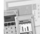
M8COM Communication option of the electronic c...