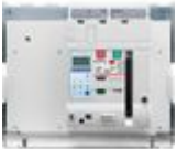
T804LE1000 Draw-out version air circuit breaker 4P ...