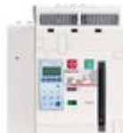
T804B800 Fixed version air circuit breaker 4P - I...