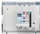
T804LE3200 Draw-out version air circuit breaker 4P ...