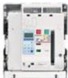
T804HE800 Draw-out version air circuit breaker 4P ...