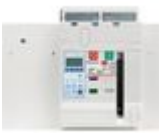
T804L2000 Fixed version air circuit breaker 4P - I...