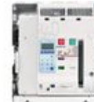
T804AE630 Draw-out version air circuit breaker 4P ...