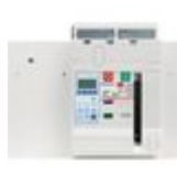
T804L1000 Fixed version air circuit breaker 4P - I...