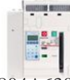
T804A630 Fixed version air circuit breaker 4P - I...