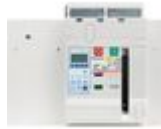
T804H4000 Fixed version air circuit breaker 4P - I...