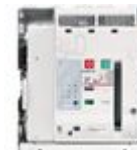
T804BE1250 Draw-out version air circuit breaker 4P ...