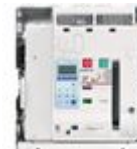
T804BE800 Draw-out version air circuit breaker 4P ...