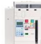
T804H1000 Fixed version air circuit breaker 4P - I...