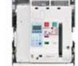
T804LE1600 Draw-out version air circuit breaker 4P ...