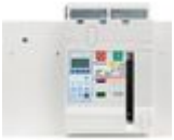
T804H3200 Fixed version air circuit breaker 4P - I...