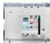
T804LE800 Draw-out version air circuit breaker 4P ...