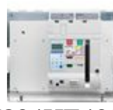
T804HE4000 Draw-out version air circuit breaker 4P ...