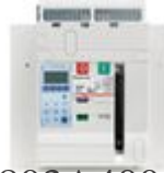
T803A4000 Fixed version air circuit breaker 3P - I...