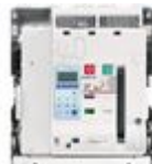
T804BE630 Draw-out version air circuit breaker 4P ...