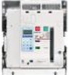
T804AE1000 Draw-out version air circuit breaker 4P ...