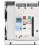
T804HE630 Draw-out version air circuit breaker 4P ...