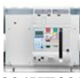
T804HE3200 Draw-out version air circuit breaker 4P ...