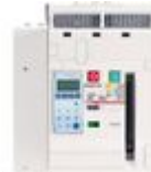
T804H2000 Fixed version air circuit breaker 4P - I...