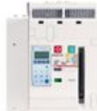
T804H1600 Fixed version air circuit breaker 4P - I...