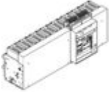
T804L5000 Fixed version air circuit breaker 4P - I...