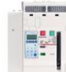
T804B1600 Fixed version air circuit breaker 4P - I...