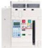
T804H1250 Fixed version air circuit breaker 4P - I...