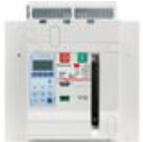
T803L2000 Fixed version air circuit breaker 3P - I...