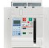
T803L3200 Fixed version air circuit breaker 3P - I...