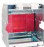
M804B1 Draw-out base for circuit breakers 4P up...