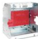
M803B2 Draw-out base for circuit breakers 3P fr...