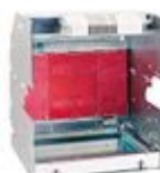
M804B1600 Draw-out base for circuit breakers 4P up...