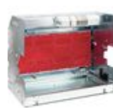
M804B2 Draw-out base for circuit breakers 4P fr...