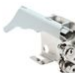
MT805EP Keylock with IN/test/OUT position with k...