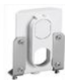
MT806AT Block preventing the connection of draw-...