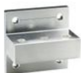
MT8HV4P2 Adjustable terminals 4P - step 130mm...