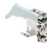
MT805EP Keylock with IN/test/OUT position with k...