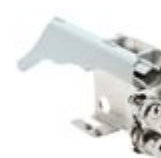
MT805EP Keylock with IN/test/OUT position with k...