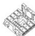
M7B25 Base 3P with front terminals for circuit...