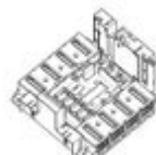
M7B25 Base 3P with front terminals for circuit...