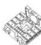
M7B25 Base 3P with front terminals for circuit...