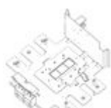
M7B29 Transformation kit to apply at the circu...