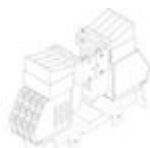
M7B21 Contact for draw-out version for circuit...