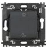
L4574CW Wireless Night&Day scenario control. Dev...