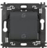
L4570CW Home / Away wireless switch. It is equip...