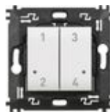
N4575CW Wireless scenarios control equipped with...