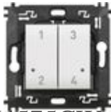
N4575CW Wireless scenarios control equipped with...