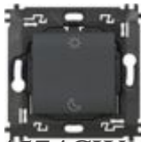
L4574CW Wireless Night&Day scenario control. Dev...