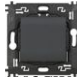
L4003CW Wireless light switch. It allows the ON ...