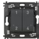
L4575CW Wireless scenarios control equipped with...