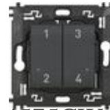
L4575CW Wireless scenarios control equipped with...