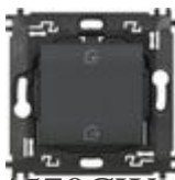
L4570CW Home / Away wireless switch. It is equip...