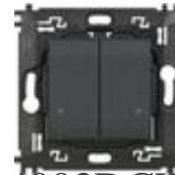
L4003DCW Double wireless light switch. It is equi...