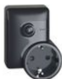
4141PC Connected plug&play socket - Directly co...