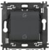
L4570CW Home / Away wireless switch. It is equip...