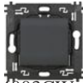
L4003CW Wireless light switch. It allows the ON ...