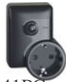
4141PC Connected plug&play socket - Directly co...