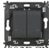
L4003DCW Double wireless light switch. It is equi...