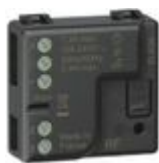
3584C Connected lighting micromodule. It allow...