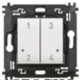
N4575CW Wireless scenarios control equipped with...