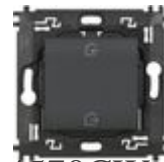
L4570CW Home / Away wireless switch. It is equip...