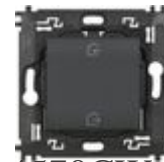
L4570CW Home / Away wireless switch. It is equip...