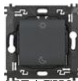
L4574CW Wireless Night&Day scenario control. Dev...