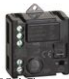
3584C Connected lighting micromodule. It allow...