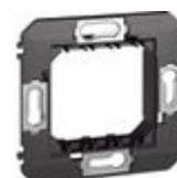
K8102 Support for the installation of the elec...