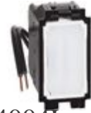
K4004L 1P 10 AX, 250 Va.c. LIT intermediate swi...