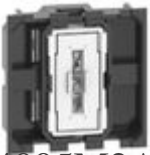
K4005M2A 1P 10 AX, 250 Vac pushbutton, automatic ...