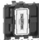
K4001M2A 1P 10 AX, 250 Va.c. one way switch, auto...