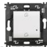
N4570CW Home / Away wireless switch. It is equip...