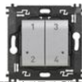
NT4575CW Wireless scenarios control equipped with...