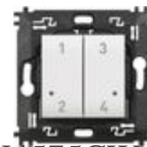
N4575CW Wireless scenarios control equipped with...