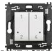
N4575CW Wireless scenarios control equipped with...