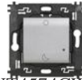
NT4574CW Wireless Night&Day scenario control. Dev...