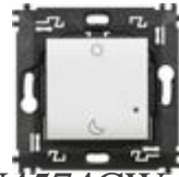
N4574CW Wireless Night&Day scenario control. Dev...