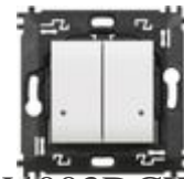
N4003DCW Double wireless light switch. It is equi...