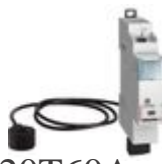
F20T60A Smart DIN meter. It allows to measure th...