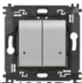
NT4003DCW Double wireless light switch. It is equi...