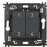
L4575CW Wireless scenarios control equipped with...