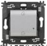
NT4570CW Home / Away wireless switch. It is equip...