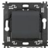
L4003CW Wireless light switch. It allows the ON ...