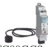
FC80GCS Connected DIN load management module for...