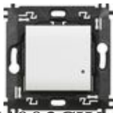
N4003CW Wireless light switch. It allows the ON ...