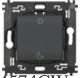
L4574CW Wireless Night&Day scenario control. Dev...