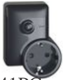
4141PC Connected plug&play socket - Directly co...