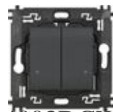
L4003DCW Double wireless light switch. It is equi...