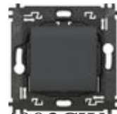
L4003CW Wireless light switch. It allows the ON ...