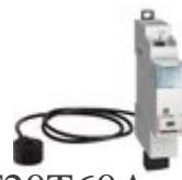
F20T60A Smart DIN meter. It allows to measure th...