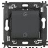
L4570CW Home / Away wireless switch. It is equip...