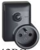
4142PC Mobile connected French/Belgian standard...