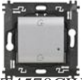
NT4570CW Home / Away wireless switch. It is equip...