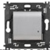
NT4003CW Wireless light switch. It allows the ON ...