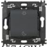
L4574CW Wireless Night&Day scenario control. Dev...