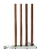
FBS/850HN Busbar ladder insulator for cabinets HDX...