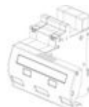
F80KM3 Mechanical interlock for BTDIN 3 modules...