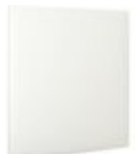
F315PB36D2 Switchboard LINEA SPACE - 2x18 modules -...