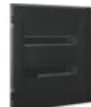
F315P36D2 Switchboard LINEA SPACE - 2x18 modules -...