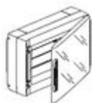
F305PT18 Wall mounted switchboard with box and tr...