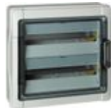
F107N18H Horizontal multifunction box for switchb...