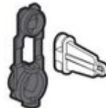
F107NPB Sealing kit (2 sealable screw plumb bobs...