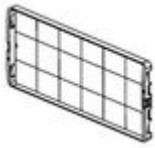
F107PA18 Fastening full panel for 18 modules IDRO...