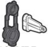
F107NPB Sealing kit (2 sealable screw plumb bobs...