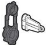
F107NPB Sealing kit (2 sealable screw plumb bobs...)