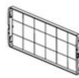
F107PA18 Fastening full panel for 18 modules IDRO...