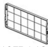
F107PA18 Fastening full panel for 18 modules IDRO...