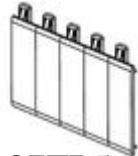
F107FP5 Blanking module front cover for switchbo...