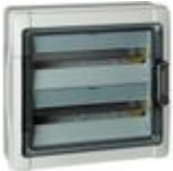
F107N18H Horizontal multifunction box for switchb...