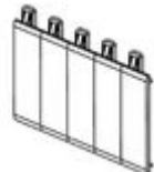
F107FP5 Blanking module front cover for switchbo...