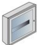
E109C/12D E109 Series metal-sheet wall-mounting di...