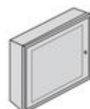
E109P/12D E109 Series metal-sheet wall-mounting di...