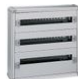
94530P SDX-P - plastic wall- mounting distributi...