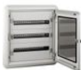
94530I SDX-I - flush-mounting distribution board...