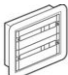
94520I SDX-I - flush-mounting distribution board...