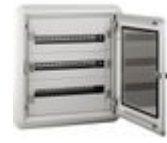
94530I SDX-I - flush-mounting distribution board...