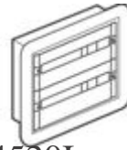
94520I SDX-I - flush-mounting distribution board...