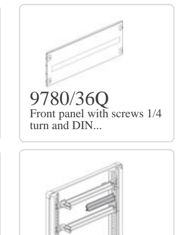
FEN7039 Depth adapter for Megatiker placed sid-b...