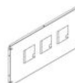
9533N24MR Front panel for circuit breakers M1 160 ...