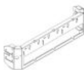
9061TME Sliding frame for circuit breakers M1 16...