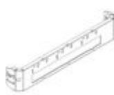
9081TME Sliding frame for circuit breakers M1 16...