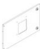
9531/ETN Front panel for circuit breakers M160-63...