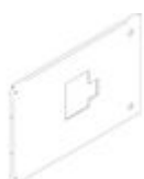
9531/02ECM Front panel for circuit breakers M160-25...