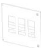
9532/RTN Front panel for M160-250 circuit breaker...