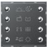
H4652 Control with 8 KEYS for control light, a...