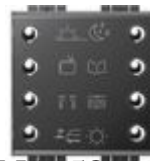
LN4652 Control device 8 buttons for light and a...