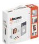
363911 One-family handsfree kit with: connected...