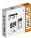
364614 One-family handsfree kit with: Classe 10...