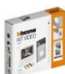
364614 One-family handsfree kit with: Classe 10...