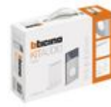
364232 One-family handsfree kit with Classe 100...