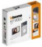
364612 One-family handsfree kit with Classe 100...