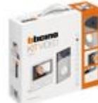
364922 One-family handsfree kit with Classe 100...