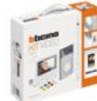
364932 One-family handsfree kit with: Classe 10...