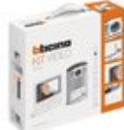
364618 One-family handsfree video kit with indu...