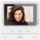
344682 Classe 100X16E with Netatmo 2 wires / Wi...