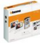
364622 Two-family handsfree video kit consistin...