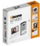
364613 One-family handsfree video kit consistin...