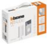
364231 One-family audio kit with Classe 100A16M...