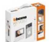
364922 One-family handsfree kit with Classe 100...