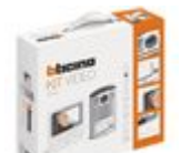
364618 One-family handsfree video kit with indu...