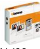
364622 Two-family handsfree video kit consistin...