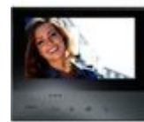
344643 Connected 2 wire / Wi-Fi handsfree vide...