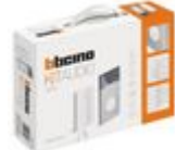
364231 One-family audio kit with Classe 100A16M...