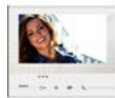
344642 Connected 2 wire / Wi-Fi handsfree vide...