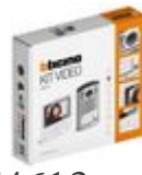
364613 One-family handsfree video kit consistin...