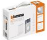
364232 One-family handsfree kit with Classe 100...