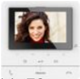
344672 Classe 100 2 wires handsfree video inter...