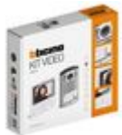
364613 One-family handsfree video kit consistin...