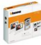
364622 Two-family handsfree video kit consistin...