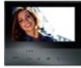
344643 Connected 2 wire / Wi-Fi handsfree vide...