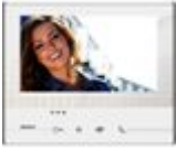
344642 Connected 2 wire / Wi-Fi handsfree vide...