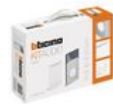
364232 One-family handsfree kit with Classe 100...