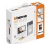
364932 One-family handsfree kit with: Classe 10...