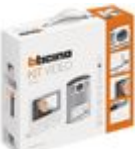
364618 One-family handsfree video kit with indu...