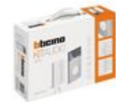
364231 One-family audio kit with Classe 100A16M...