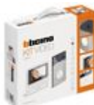
364922 One-family handsfree kit with Classe 100...