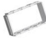
150645N POP-UP box support for 4 modules Living-...