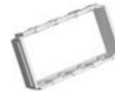
150646NN POP-UP box support for 4 modules Matix...