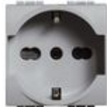
NT4140/I6 Socket 2P+T 16A 250 Vac - centre distanc...